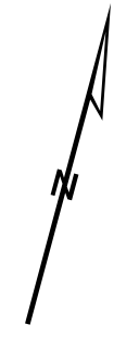
KEY PLAN SCALE 1 : 100 000